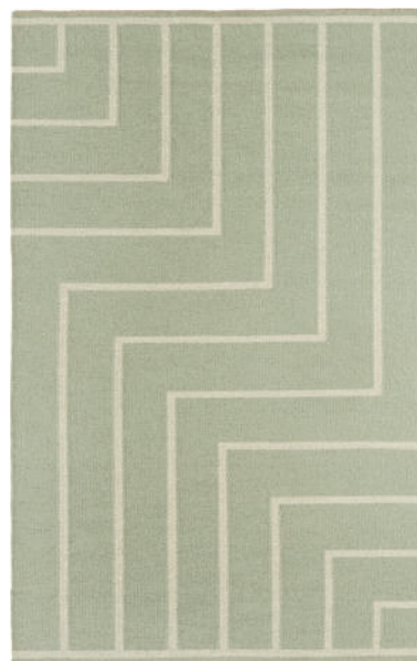
Rug VK-1 Olive White