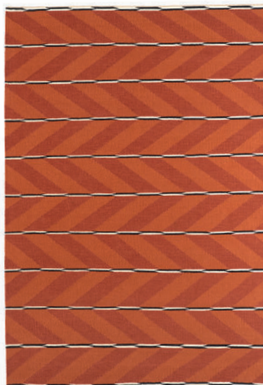
Rug VK-6 Red Orange