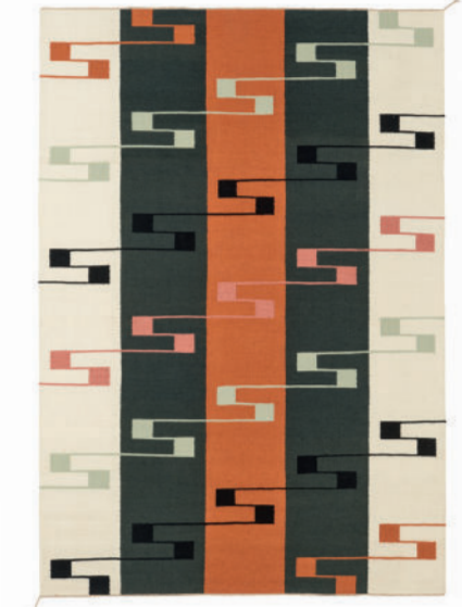
Rug VK-8 Charcoal White Orange