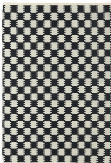
Rug VK-5 Black White