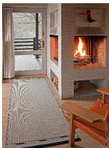
House of Architect Børge Mogensen, Gentofte, Denmark