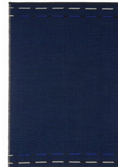
Rug VK-4 Blue