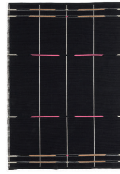
Rug VK-9 Black White Pink Camel

* Vibeke Klint (1927-2019) Vibeke Klint has been described as the 20th century's most significant Danish weaver and textile artist.