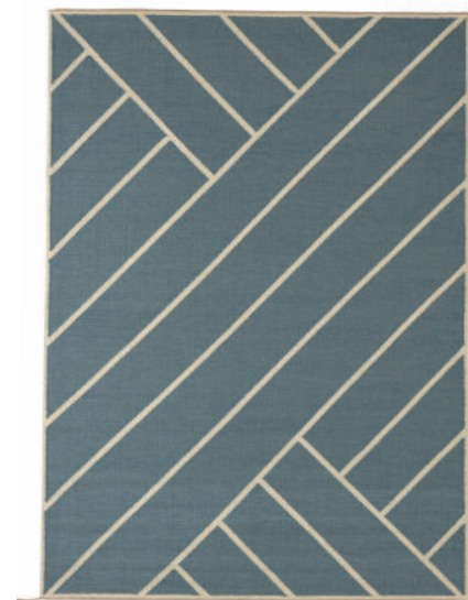
Rug VK-2 Light blue White