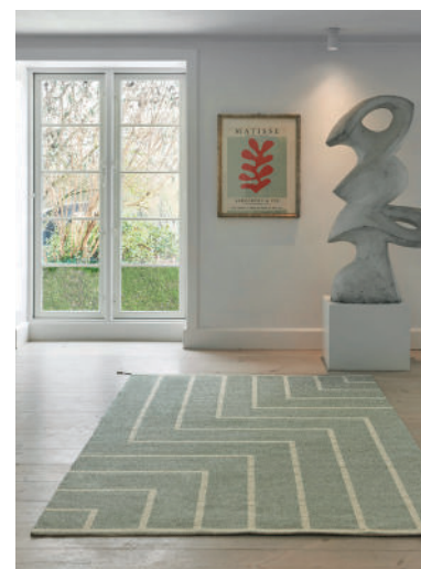
Traditional Country House Ålsgårde, Denmark